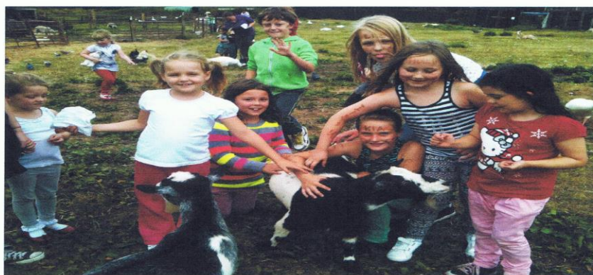
Children from Mistley Kids Club enjoying an outing during the summer holiday programme

Mistley Kids Club have recently joined the Catalyst Respite scheme. They provide an after school and holiday club for children with additional social, emotional and medical needs. They accept children within the age range of 4-16 (up to 19 if they have special needs).